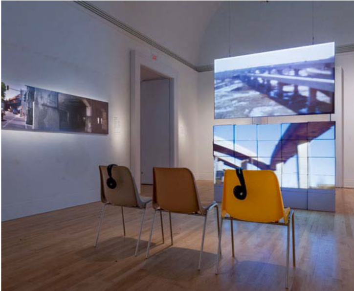
ABC : MTL, installation view, 2012.

A Curatorial Experiment Focusing on Montréal as a natural test case for the CCA, this project combines a bottom-up process of conceptualization with a collective notion of authorship. "With this project the CCA is testing new models of curating and producing exhibitions and programs in an institutional framework, and we do so by focusing on the exploration and representation of the contemporary city," says CCA Director and chief curator Mirko Zardini. "The city is the realm that grounds architecture in society. ABC : MTL suggests a new urban lexicon, showcasing alternative lifestyles, ways to reinvent our daily lives, and allowing us to rediscover the urban space through innovative ideas, practises and experiences. This experiment is conducted on our home-city of Montréal, but could be applied to any other city in future iterations of the project."