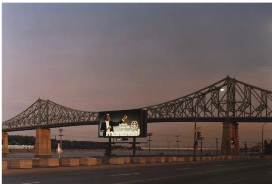
Gabor Szilasi, Série denseignes lumineuses, La Fierté a une ville, Montréal. 1983. CCA Collection. © Gabor Szilasi