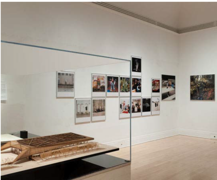
ABC : MTL , installation view, 2012.

Canadian Centre for Architecture 1920 Rue Baile 514-939-7000 Montreal ABC : MTL