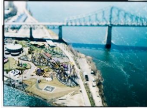
A selection of publicly generated images portray Montreal's dynamic nature in CCA's latest project. (journalmetro.com)

Written by: Lauren Wray Posted date: November 19, 2012