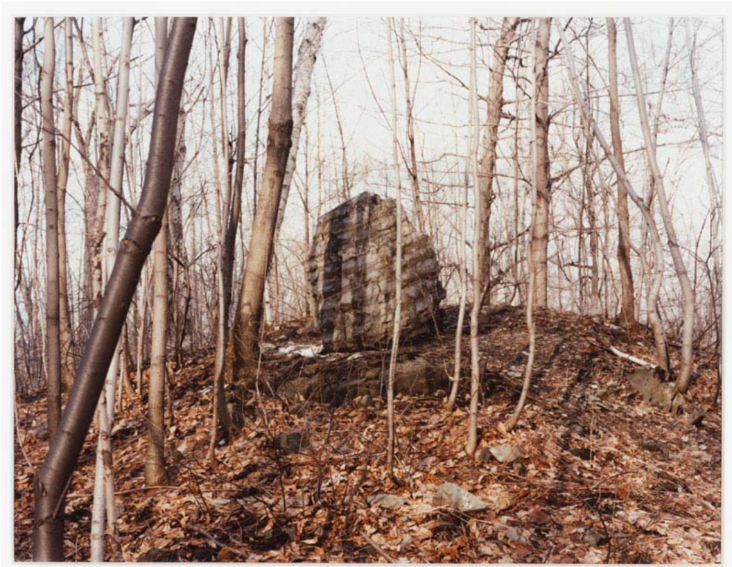
Robert Burley, Rock in the woods, Mont Royal , 1990. CCA Collection. © Robert Burley, From the Viewing Olmsted series. Chromogenic colour print, 27.9 x 35.5 cm.